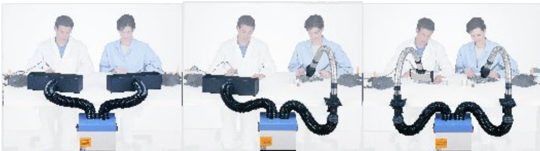
2 x Metal Plenum 8886-0366 Includes 2.5m Flex Hose