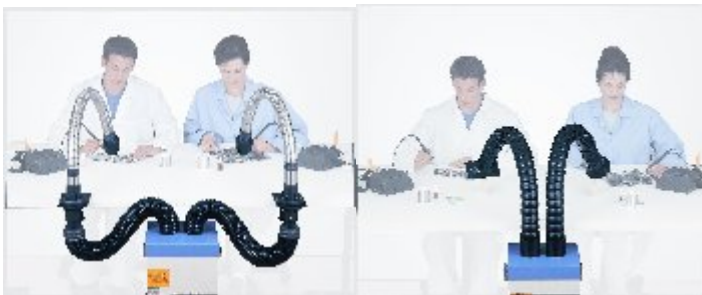
2 x 45mm Flex Arms 8886-0429 2 x Bench Mounting Brkt 8886-0552 2 x Reducer 75-50mm 8886-0299